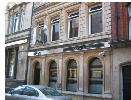
Walters Hull Pub of the Year 2009